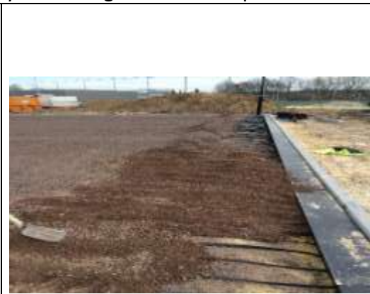
Installation of a cable gutter with entry of heating ribbons length wise approx. 3 inch deep