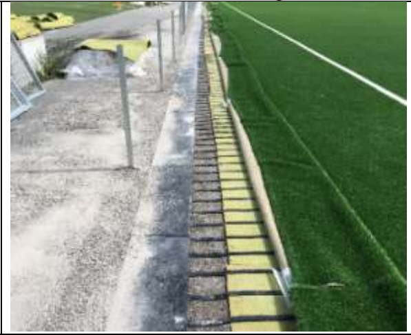
Installation of a cable gutter with entry of heating ribbons on top side