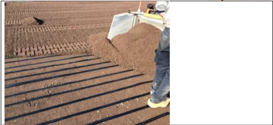
On top of the ribbons 1.5 – 2 inch of sand or dirt/clay