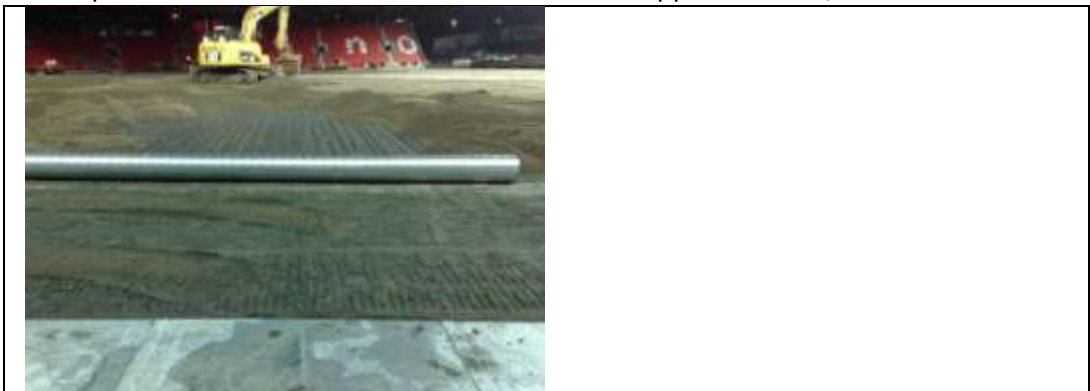
On top of the ribbons 30 c / 0.9 ft of sand.