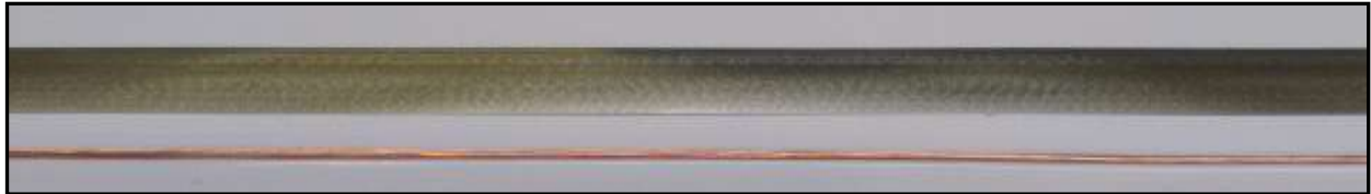
Amorphous heating material in comparison to traditional heating wire.

HSI Field De-Icing Heating Ribbons utilize amorphous metal technology to generate heat. This technology reduces the energy consumption compared to standard copper based heating wires.